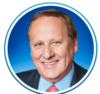
HON STEPHEN DAWSON MLC MINISTER FOR REGIONAL DEVELOPMENT

A handwritten signature in black ink, appearing to be 'D Punch'.